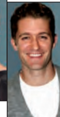
Will Schuester Glee