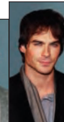
Damon Salvatore Vampire Diaries