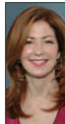
Katherine Mayfair Desperate Housewives

We've seen Betty Draper's sweet and demure personality tempt every man she meets. Now she sees it too. No longer content playing the scorned housewife, Betty has taken the pursuit of happiness into her own hands as she grows into a leading lady modern women can relate to.