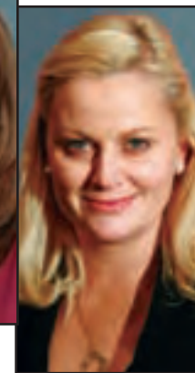
Leslie Knope Parks and Recreation