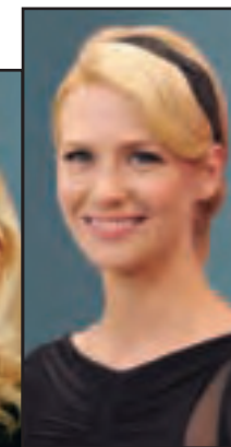
Betty Draper Mad Men